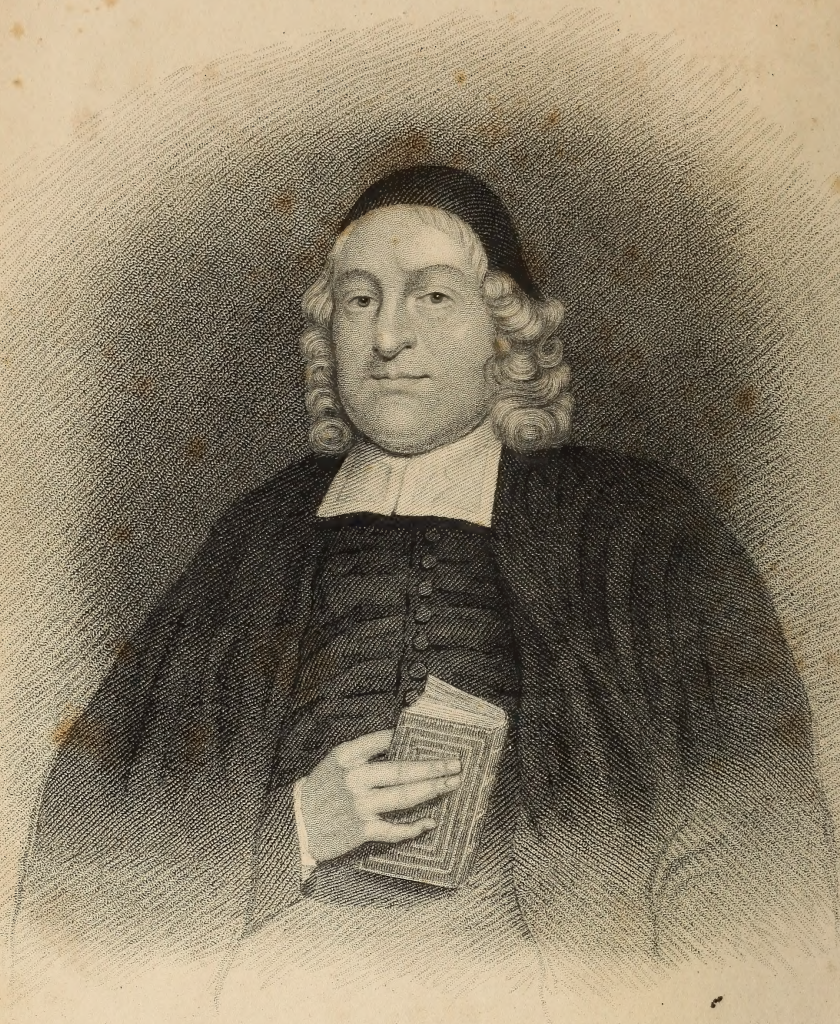
REV d OLIVER HEYWOOD.